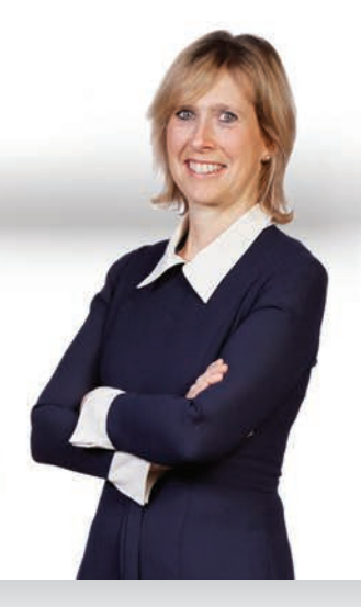
Lucilla Waugh Construction and Engineering Team

Tel: 0191 211 7943 Mobile: 07711 514 017 will.mckay@muckle-llp.com